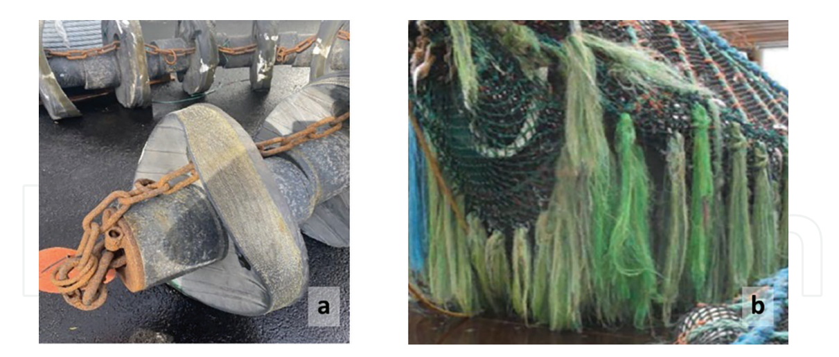
Figure 1. Worn-out rockhopper gear (a) and dolly rope used to protect the trawl (b).

In conversations with Norwegian shipping companies and gear manufacturers, Norwegian vessels mainly use 21-inch discs weighing between 20 and 23 kg, depending on the manufacturer. Thus, in the calculations, we used a weight per disc W_{disc} = 21 kg. Gear has five sections, two starboards, two ports, and one center gear. Each section consists of 21 discs, giving a total of N_{disc} = 105.