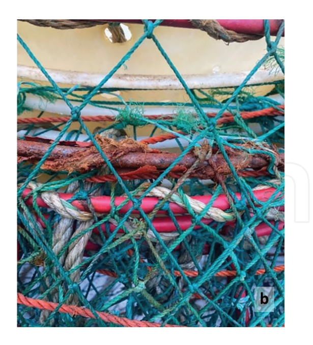
Figure 3. Snow crab pot (a), with cracked coating (b).

in each string. Finally, we estimate the average wear percentage based on fishers' and manufacturers' information.