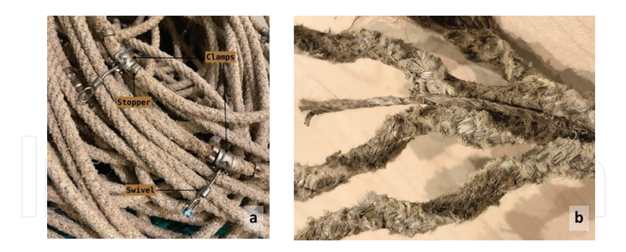
Figure 4. Autoline with stoppers, swivels, and clamps (a) and a worn-out autoline with the cords split apart (b).

On a traditional autoline vessel, the hauling equipment is located on the vessel's starboard side. However, there has been a shift toward hauling through moonpools in the center of the vessels. As the moonpool is placed with the lowest magnitude, it may reduce wear on the line. However, this is only an assumption as no such research exists in the area.