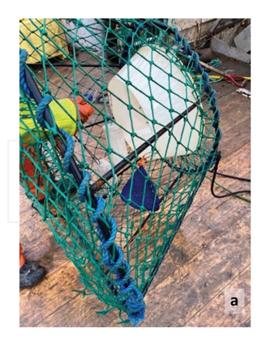
Microplastics Derived from Commercial Fishing Activities DOI: http://dx.doi.org/10.5772/intechopen.108475