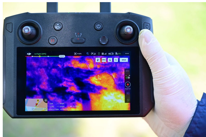
Fig. 1: Thermal imaging produced by a DJI Mavic 2 enterprise drone equipped with a thermal sensor for checking people's temperature deployed in Treviolo, Italy [7].

The current COVID-19 virus has already been declared a pandemic by the World Health Organization (WHO) [1]. We are already witnessing the greatest pandemic of the decade. Millions of people are being infected, resulting in thousands of deaths every day across the globe [2, 3]. The count of infections due to the spread of the virus is increasing at an alarming rate, at least in China, although COVID-19 vaccines have been successfully developed [4]. We believe that innovative technologies could help reduce the pandemics to a certain extent until we find a definite solution from the medical field to handle and treat such pandemic situations [5]. We must embrace ourselves by leveraging innovative technology to prepare ourselves to tackle future pandemics. Application of such innovative technologies should lead to progress, making our lives better and easier in both a physical and psychological way. Technology innovation has the potential to introduce new technologies that could support people and society during these difficult times [6].