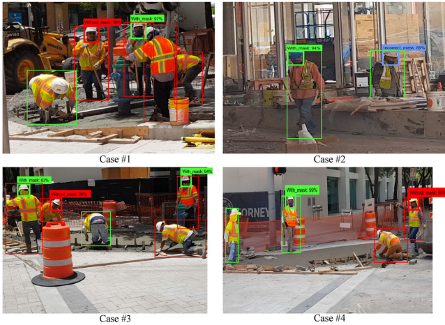
Fig. 4: Application of AI for face mask monitoring [22].

An AI-equipped surveillance camera being deployed on a bus in Cannes, France, is shown in Figure 3. This innovative solution could send an alert if a person is not obeying the rules to wear masks in public places. With the same motive, the AI-equipped cameras on our COROID drones can automatically monitor and send a warning signal when it detects a person who is not wearing masks and violating the rules. A successful use case of monitoring construction workers for face masks is shown in Figure 4, which is carried out in Ref [22].