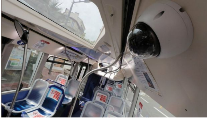
Fig. 3: Surveillance camera on a bus in Cannes, France [21].