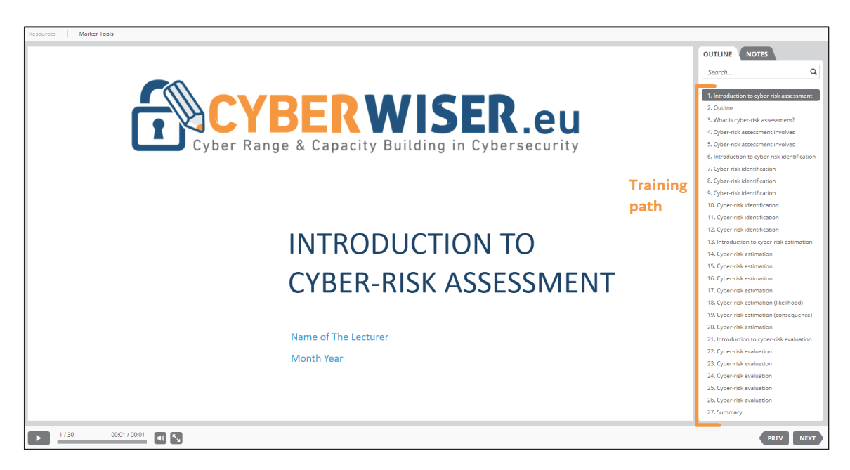
Figure 3: A screenshot from our cyber range showing the course Introduction to cyber-risk assessment.