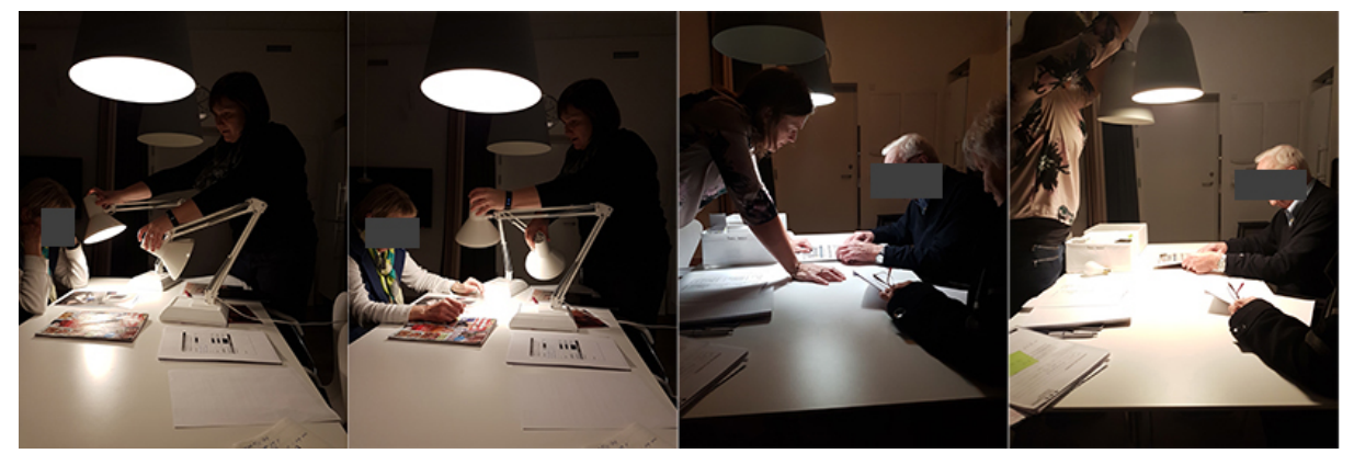
Figure 2. Testing different lighting in the lighting lab.

The consultants performed a range of translations to decontextualise the conditions of the home environment and recontextualise them in the lighting lab. Translations were contained in the transcriptions of the notes from the narrative interviews, test results, measurements, photos, and drawings. The embedded knowledge of the spectrometer and how it measured the specific lux value is in itself black boxed. However, when used as support for the embodied knowledge of the impaired, the everyday knowledge of the household, and the practice knowledge of the consultant, the explicit and scientific knowledge was contextualised and operationalised. Focusing on activities and how these were enabled or disabled by the interaction of the luminous environment and the vision the procedure of translation included the narrative and descriptions of the embodied experience, the observed occupational performance, and the measured light.