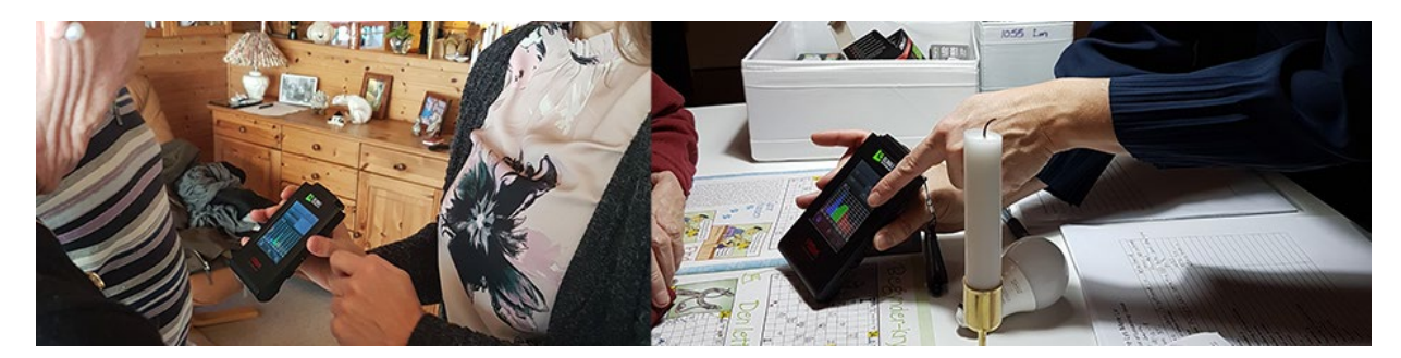
Figure 1. Using the spectrometer to communicate qualities and quantities of different light.

The diagnosis and data concerning the vision, from the optometrist or from CSU's database were also used in the consultations. In some consultations where the conditions were discussed, the consultant provided general knowledge of the disease or the expected development of it. In some cases, general knowledge also involved information about the opportunities for funding or support in the public health system.