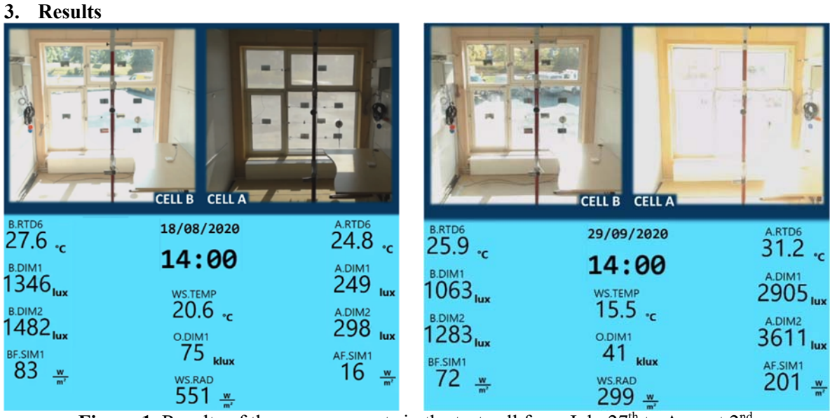
Figure 1. Results of the measurements in the test cell from July 27<sup>th</sup> to August 2<sup>nd</sup>.

Figure 1 shows a screenshot of the custom control and monitoring interface developed for the measurements giving a view from inside the cells on two days (August 18<sup>th</sup> and September 29<sup>th</sup>) to show two situations in which the EC is active, and the integrated screen is respectively fully deployed and undeployed. The figure also contains the parameter of interest measured at that time by the sensors. A first visual analysis suggests how the EC device can reduce the internal illuminance in a sunny day, while still letting the occupants have a view of the surroundings.