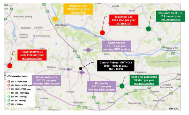
Figure 2: Map showing the Kutno area, three district heating systems in nearby municipalities and potential (perspective and not perspective) CO<sub>2</sub> sources.

For Mogilno-Łódź Trough (Kutno area), a detailed analysis regarding the potential CO<sub>2</sub> sources, as well as nearby (from 2 to 15 km) heat demand in district heating systems, was done. As presented in Figure 2, the area has potentially favorable temperatures between 160 and 190 °C at depths of 5000 to 6000 meters below sea level. In the near vicinity, significant perspective industrial CO<sub>2</sub> sources were identified, associated with the refineries and their power generation plants. Other nearby CO<sub>2</sub> sources, mainly the lignite-fired power plant in Pątnów, are rather not suitable long-term sources of carbon dioxide, due to the planned decommissioning in the coming years.