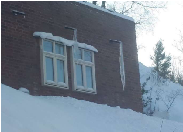
Fig. 2. Snowmelt re-freezing after running off a compact roof through external drainage.