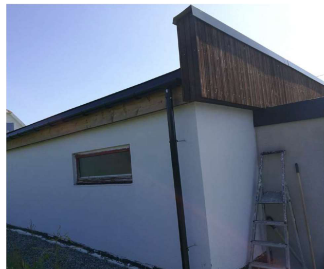
Fig. 3. Solution described by actors in Mosjøen; a compact roof with parapet on three sides and an external gutter on the remaining side. Here pictured at Valderøya outside Ålesund.

damage. They have not heard of damage due to ice formation on the end of the roof (above the wall) or along the gutter (which will also be colder than the parts of the roof where water will flow from). The solution is pictured in Fig. 3.