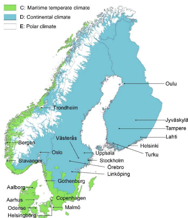
Fig. 4: Climate zone chart for the Nordic countries, from [19].

Fig. 4 shows a map of the climate zones in the Nordic countries, adapted from [19]. The areas where exterior drainage from compact roofs seem to work well all lie within the Maritime temperate zone, while the solution is shown not to work well in the Continental climate zone. This allows the results obtained in Norway to be extrapolated for the rest of the Nordic countries as well.