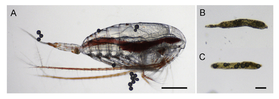
Fig. 3. Calanus finmarchicus (A) surrounded by non-ingestible 90–106 µm PE particles showing the relative size to the animal, as well as feces of Calanus finmarchicus demonstrating excretion of encapsulated PE particles sizes 3–16 µm (B) and 45–53 µm (C). Scale bar A: 500 µm. B–C: 100 µm

well as to some extent MP particles up to \sim 50 µm diameter (Fig. 3) but were not able to ingest MP particles of 100 µm diameter. A size cut-off could not be visually confirmed for A. tonsa as the small size and transparency of the MP particles, combined with the partial opacity of the copepods, prevented an unequivocal identification of the particles inside the organisms (data not shown). For the purposes of the current study, 100 µm particles were used to represent non-ingestible MP and 10 µm particles (mean size) used to represent ingestible MP for both species, the latter falling within the size range of natural algae prey. The results highlight that only a limited size range of MP particles are ingestible by copepods, and that the specific cut-off size may vary from species to species. Although determination of ingestion and excretion rates were not a focus of the current study, ingested particles were clearly observed encapsulated in feces from C. finmarchicus demonstrating both ingestion and egestion in this species for solid particles up to 50 \mu m (Fig. 3). No increase in mortality (relative to seawater controls) was observed in copepods exposed to PE MP of either size.