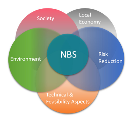
Figure 1. The PHUSICOS project's scheme of main ambits that can be affected by NBSs.

The identification, the use and the evaluation of indicators for NBS performance assessment represent a core part of the ongoing EC H2020 project PHUSICOS, coordinated by NGI. The main subject for PHUSICOS is the reduction of risk from extreme weather events, such as floods landslides and drought, in rural mountain landscapes. The indicators are aimed at estimating the benefits of NBS (or hybrid solutions) during the whole process (from baseline to the long-term scenario) in relation to the 5 principal ambits: Risk reduction, Technical feasibility, Environment and ecosystem, Society and Local Economy (Figure 1).