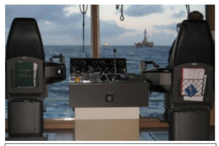
Picture 5: The bridge - winch is handled from the left chair, the vessel from the right

The great tension of the anchor systems poses a considerable danger, not just for capsizing the vessel. More often, accidents or so-called near-missincidents endanger the sailors working on deck. The wires recovered from the seabed might be twisted, releasing energy stored by the twist when they are pulled up. If a wire snaps, the backlash would seriously hurt anyone being hit. The entire system of activities is potentially dangerous, and at the same time, the work conducted out on deck is both physically demanding and conducted in harsh environments. Therefore, it is of great importance that there are no misunderstandings that the deck is clear when tension is released on the system, that a bolt is not left inside or not fastened when it should not, and so on. The bridge and the deck crew therefore depend