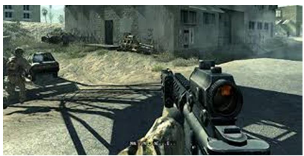
Figure 3 - snapshot of COD

The participants were tested on visuospatial skills with the paper folding test (PF) and on FPS gaming skills by performing the introduction route on Call of Duty IV (COD) as indicated in Figure 3.