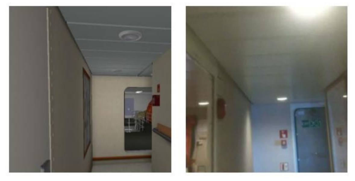
Figure 1 - Snapshots for the same view point in Edda Fauna in the simulator (left image) and in reality (right image)

In the pursuit of addressing the challenges with regards to familiarization, the Norwegian shipping company Østensjø AS developed a Health and Safety Environment (HSE) simulator modelled on the Edda Fauna maritime vessel. With regards to the modelling of the environment, some simplifications were made as evidenced in the comparative snapshots of the same view point from the simulator and reality captured in Figure 1. In addition to simplifications, the doors of passageways were always modelled open in the virtual familiarization whilst in reality, those same doors were always closed. However doors not intended as part of the familiarization were typically modelled as always closed, whereas in real life these were often open – such as the door to a client office, to the left in the picture.