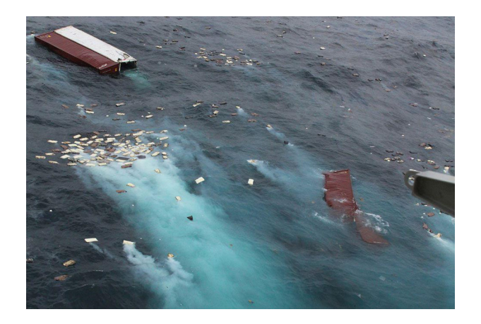
Fig. 2 Containers breaking up and releasing cargo. From the wreck of MV Rena , off New Zealand, October 2011.

Some of the chemicals transported are oil-soluble and float (Supplementary Table S1). Generally behaving like oil on the water, these chemicals will mix with the spilled oil and will be collected as the oil-chemical mixture is skimmed from the sea surface. A chemical that evaporates, dissolves or sinks cannot be mechanically recovered from the sea surface. The two non-oil-like substances of Oleum 's cargo either dissolve (2,4,5-trifluorobenzoic acid) or sink (BDF-513; Supplementary Table S1). The acid will quickly dissolve in water. BDF-513 has a higher density than water, is insoluble and will therefore sink. It will spread over a smaller or larger area depending on the ambient conditions, and can theoretically be collected by dredging or be left in place.