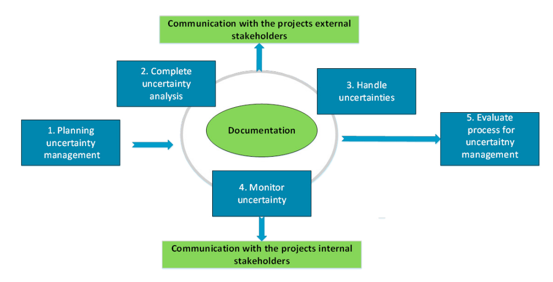
Figure 2 Practical Uncertainty Management process - (PUS web: www.nsp.ntnu.no/PUS/)

Simister underlines the importance of undertaking risk management as a structured, formal process aligned with the overall project management approach. The Norwegian research project "Practical uncertainty management in a project owner's perspective" proposes a similar model and the project also suggests that opportunities and threats should be analyzed and managed through the whole project lifecycle (see Figure 2)).