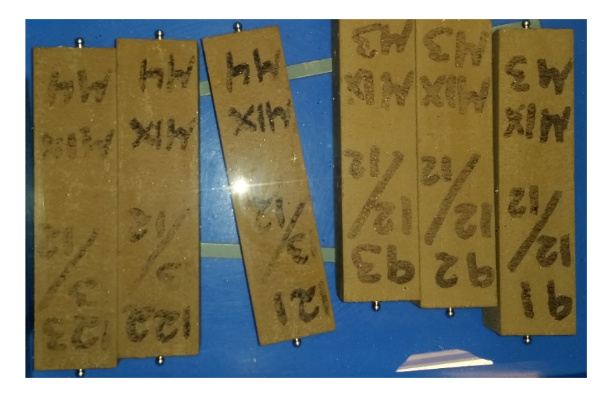
Figure 4 – Condition of mortar prisms stored in 5% Na<sub>2</sub>SO<sub>4</sub> solution for 2 years at 5°C. The brown prisms marked M3 and M4 (3 parallels) are made of mortar where 50 and 65 vol% cement is replaced with calcined marl, respectively.