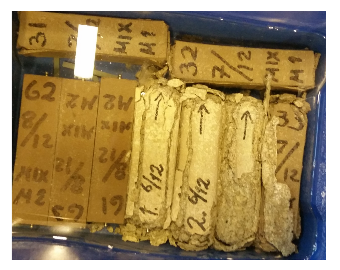
Figure 3 – Condition of mortar prisms stored in 5% Na<sub>2</sub>SO<sub>4</sub> solution for 2 years at 5°C. The light grey, deteriorated (spalled) prisms are the reference with 100% OPC. The brown ones marked M1 and M2 are mortar prisms where 20 and 35 vol% cement is replaced with calcined marl, respectively.

In short, the durability of aluminium reinforced concrete with high content of aluminate containing SCMs will be high since carbonation and chloride intrusion will not attach the binder nor the reinforcement, the binder will be resistant to sulphate attack (Fig. 3 and 4) and there is no alkali hydroxides to induce ASR in the aggregate. The only remaining common concrete degradation mechanism is freeze-thaw action, but that can be avoided with proper air entrainment and distribution when needed.