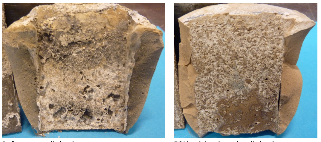
Reference, split back