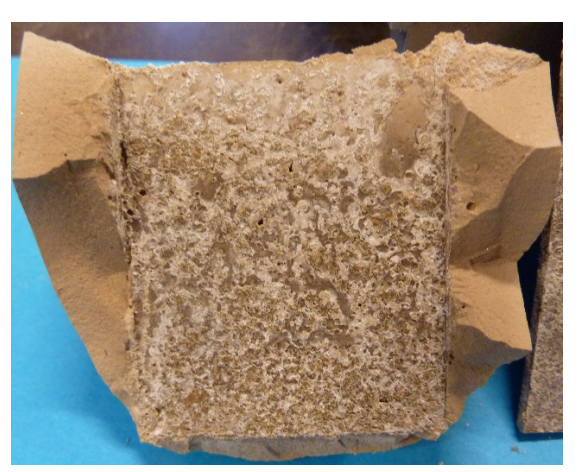
50% calcined marl, split front