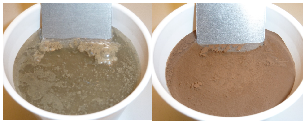
Reference paste (w/c = 0.60)

After the pastes had hardened, the samples were split and the imprints of the front and back of the aluminium plates on the pastes are shown in Fig. 2. It is clearly much more cavities in the OPC sample next to the plate, while only a few small gas voids are seen on the interface for the paste with 50% calcined marl. One cannot rule out that the minor gas voids are due to entrained air by the high shear mixer, and the only way to find out is to capture and measure the evolved hydrogen gas volume.