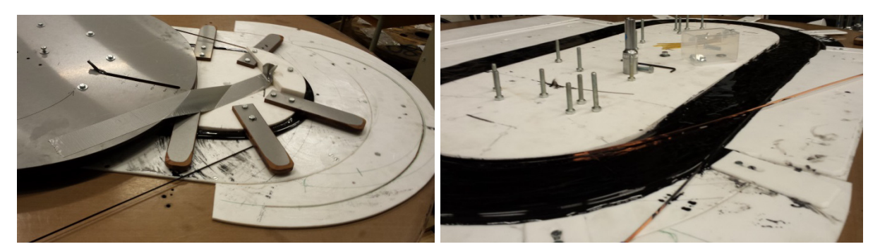
Fig. 2. Winding table during winding of the first layer (left) and second layer (right) of a double pan-cake MgB<sub>2</sub> coil.