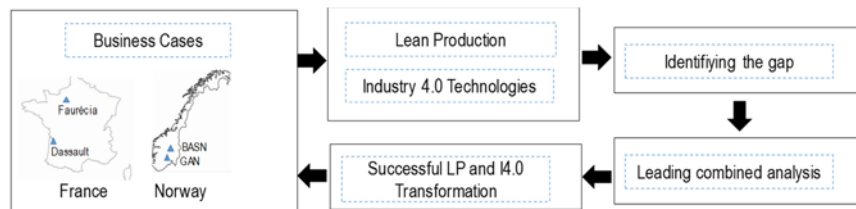
Fig. 1: Positioning of the paper – Problem statement

In the following figure (Fig. 1) we have chosen to analyze the situation regarding the common deployment of LP and I4.0 in France and Norway. Four case studies will be described (two from each country, from aerospace and automotive sectors) to perceive the strengths and / or weaknesses during the deployment of both paradigms. Indeed, an analysis of real situations reveals actionable knowledge as to how a successful combination of LP and I4.0 is possible. We also identify gaps to pursue with further research. This combined study is useful for understanding how to propose a better parallel transformation using LP and I4.0 in different companies.