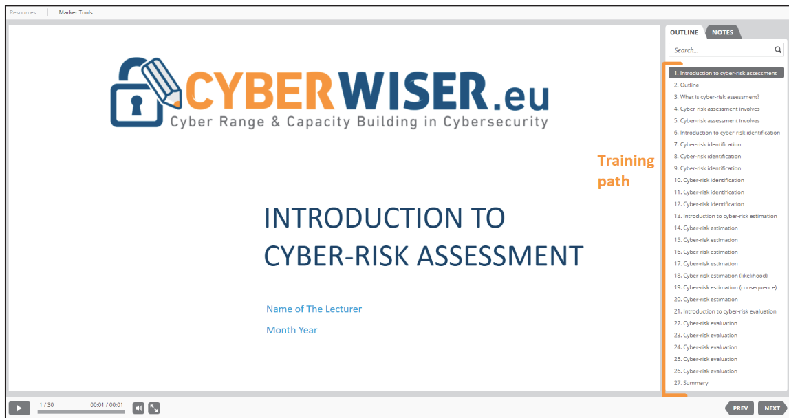
Figure 3: A screenshot from our cyber range showing the course Introduction to cyber-risk assessment .