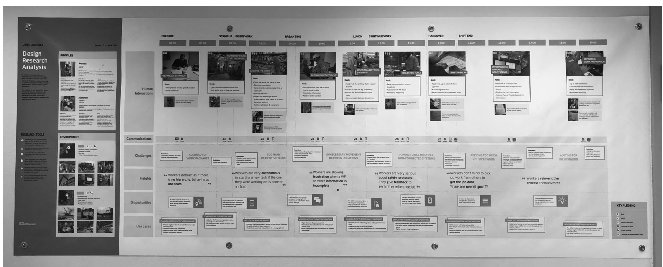
Fig. 3 User journey visualizing the research analysis

An important topic raised by most informants was that using visual communication enabled better participation in the development phase of the project. In many development projects, consideration of the look and feel of a system is introduced in later stages. In the case company, it was strategically decided to involve UX experts from the outset to improve communication: “We wanted to involve UX (user experience team) from the first day to ensure knowledge