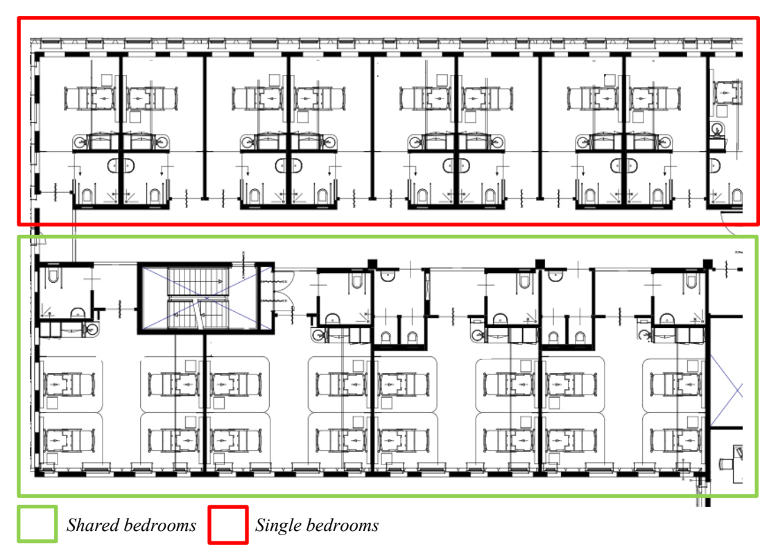
Figure 2. Fragment of inpatient ward

The views from the single bedrooms and shared bedrooms varied from a wide view to a view on another wing of the hospital building, mostly at a distance of 28 m, incidental at 21 or 15 m. The colours, finishing materials and furniture in all bedrooms were similar, intended to provide a warm and professional appearance (Figure 3). Finishing of the cupboards and bed panel had a light coloured, wood-like appearance.