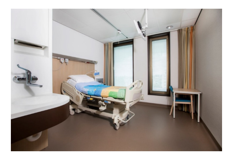
Figure 3. Colours in the patient room