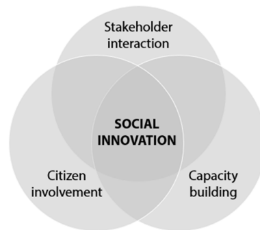
Figure 1. Social innovation approaches relevant for PED development, own figure based on [13].

to enabling social innovation within PED deployment as: citizen involvement, stakeholder interaction and capacity building (see Figure 1).