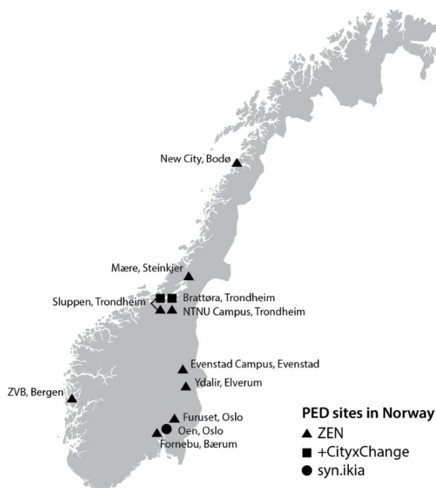
Figure 2. Units of analysis: 12 PED sites in Norway.

The three cases include twelve demo sites in Norway (Figure 2). Each demo site constitutes a unit of analysis and is presented in detail in Table 2 below.