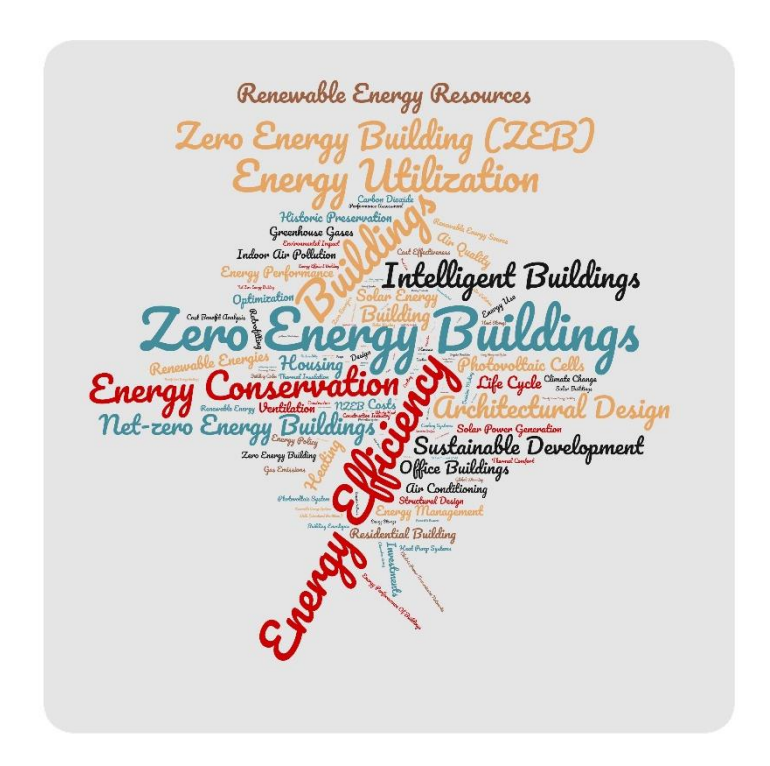
Figure 2. The keywords used globally in the literature according to Scopus [21].

The PED concept introduces an opportunity to develop a framework that introduces energy positivity on a district level, with clear guidelines for grid interaction, energy storage and renewable integration for both buildings and Electric Vehicles (EVs). The main principle of a PED is to create a district within the city that is capable of producing higher energy than it consumes, it is flexible to respond to the energy market situation and in addition to this, it contributes by improving the quality of life and wellbeing of the residents.