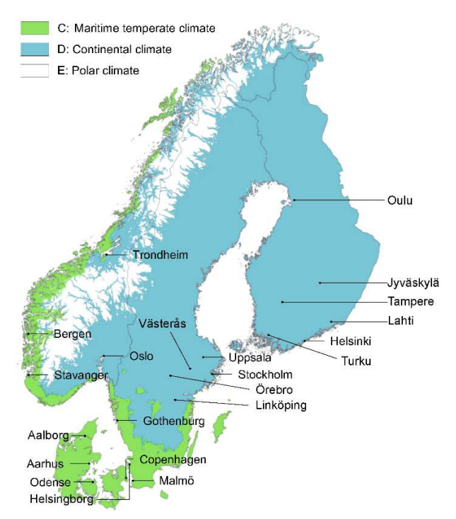
Fig. 4: Climate zone chart for the Nordic countries, from [19].

Fig. 4 shows a map of the climate zones in the Nordic countries, adapted from [19]. The areas where exterior drainage from compact roofs seem to work well all lie within the Maritime temperate zone, while the solution is shown not to work well in the Continental climate zone. This allows the results obtained in Norway to be extrapolated for the rest of the Nordic countries as well.