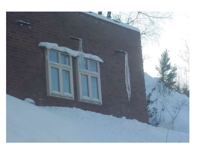
Fig. 2. Snowmelt re-freezing after running off a compact roof through external drainage.