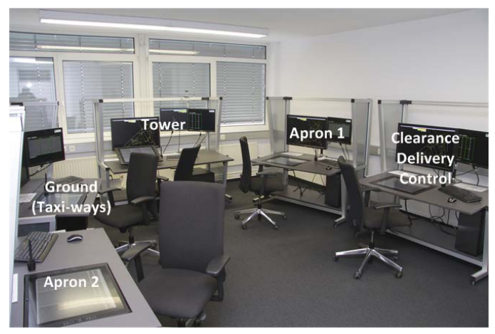
Figure 2. Control room of the Hamburg airport human-in-the-loop simulation exercise. Each controller workstation is labeled with the controller's function in the experiment.

After the last run, the participants were interviewed individually and asked to fill in a post-run questionnaire. At the end of the simulation session, the participants were encouraged to reflect on their own individual experience, performance, and decision-making during the simulation runs.