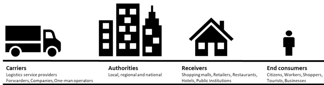
Fig. 1. Stakeholders in urban freight, with examples.

as possible by optimising load capacity, co-loading, and delivery routes (Stathopoulos et al., 2012). Receivers are the final link in the supply chain, and their main task is related to commissioning and receiving deliveries. Receivers form a complex group that responds to the demands of end consumers (Bjerkan et al., 2014; Stathopoulos et al., 2012).