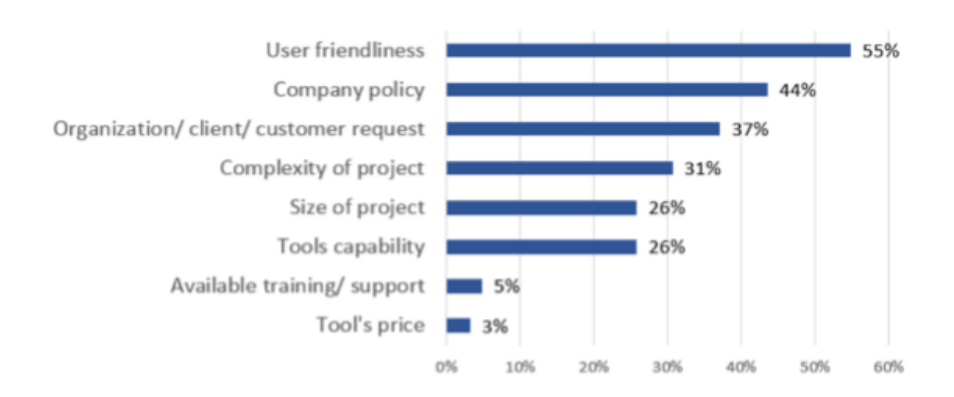
Figure 2: Reasons for using time planning tools

When it comes to the frequency of using time planning tools, 32% of the respondents use the tools at least once per month, while 27% of the respondents use the tools minimum once in a week. There can be several reasons for using the tools. According to Figure 2 the most important reasons are user-friendliness (25%), company policy (20%) and request from customer / client organization.