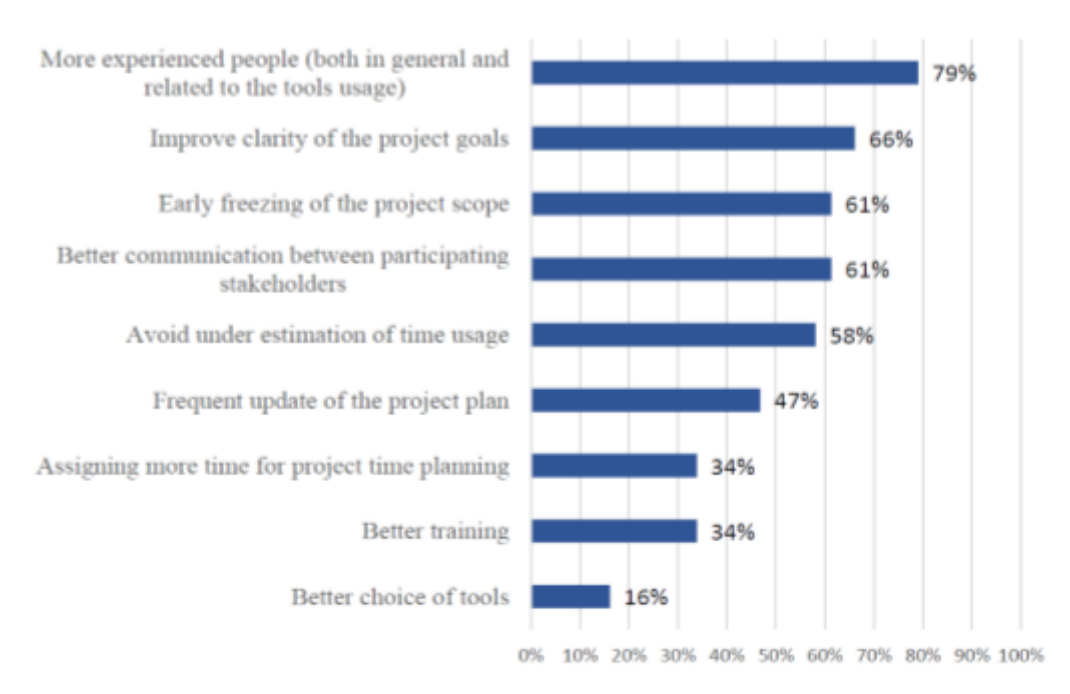
Figure 3: The enablers

In Figure 3, we see that more experienced people is considered as the most influential enablers of better time management. This shows that there is a need to focus on competence development. This does not mean that the already experienced person should do the task all the time. This experienced person can be accompanied by a novice and share knowledge and experience with the novice. In terms of Spender's (2008) knowledge categorization, this situation suggests sharing / acquiring knowledge-as-practice.