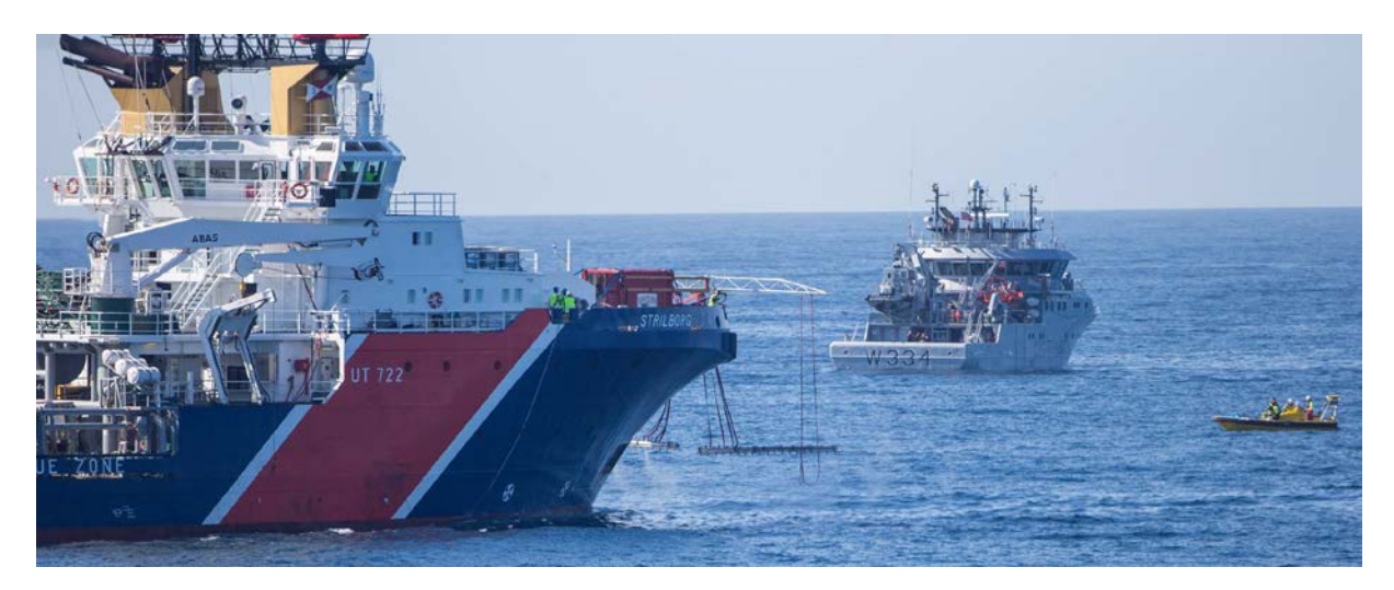
Figure 1. Overview of the two large vessels and one of the small, open air boats participating in the field trial.