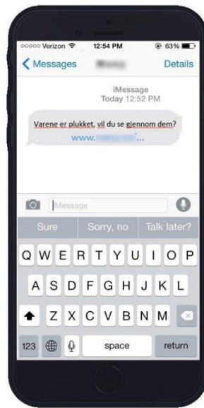
Figure 2. The Stream service. SMS from the online grocery store. The text (originally in Norwegian) is "Groceries have been collected, do you want to see them?"

The Stream is a video-based service. When the employee enters the fruit and vegetable department, his head camera is turned on, and the process of collecting the groceries is recorded. When the groceries are ready for delivery, the customers will receive an sms with a link to a video of the collection process (Figure 2). The customers can watch the video to look for the products he wants, when he wants (Figure 3). If the customer is not satisfied with the product selected, he can write a comment, and the product will be replaced before delivery.