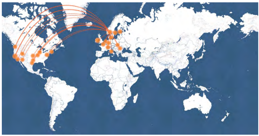
Figure 3. The map illustration shows the geolocation of the contacted services for all the tested applications. The information from the 21 apps tested in Norway communicated with primary or third-party domains all over Europe and USA.

In this study we reveal many different third-party tracking services used by the majority of the mobile apps for Android that we have tested. Figures 3 and 4 illustrate a myriad of approximately 600 different primary or third-party domains, many of them third-party trackers, communicating with the 21 mobile apps we studied. Our results are similar to findings in a recent study published in Technology Science, where 73% of Android apps shared personal information, such as email addresses, with third parties (Zang, Dummit, Graves, Lisker, & Sweeney, 2015).