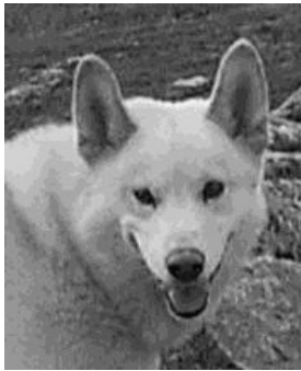
Fig. 3: 177x216 grayscale image

each subnode. This will also introduce the need for more sophisticated “slicing” of data.