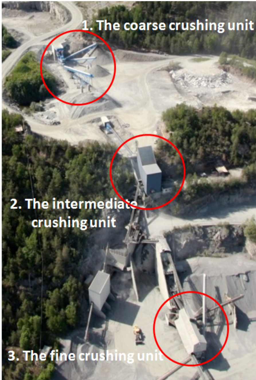
Figur 1. The production process.